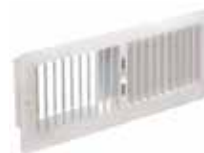
Rear register kit