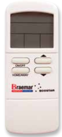
Remote control (WF25 only)