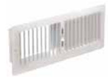
Rear register kit